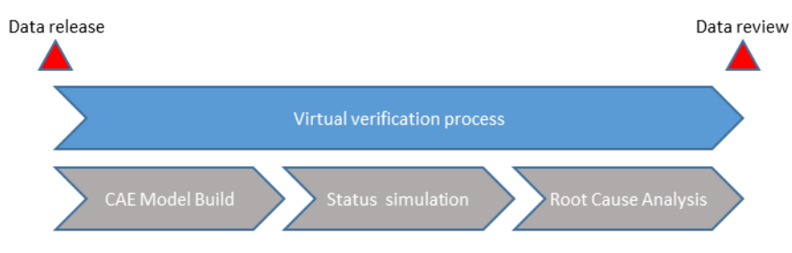
Figure 1 - Overview of virtual verification process

During the development of a new vehicle, at specific points in times, the current design is frozen and released. Virtual vehicles are created and assembled. Important attributes like safety, NVH and durability are analysed virtually to ensure that requirements are fulfilled. All results provide a clear picture of the status of the project. This of course needs to be performed as quickly as possible.