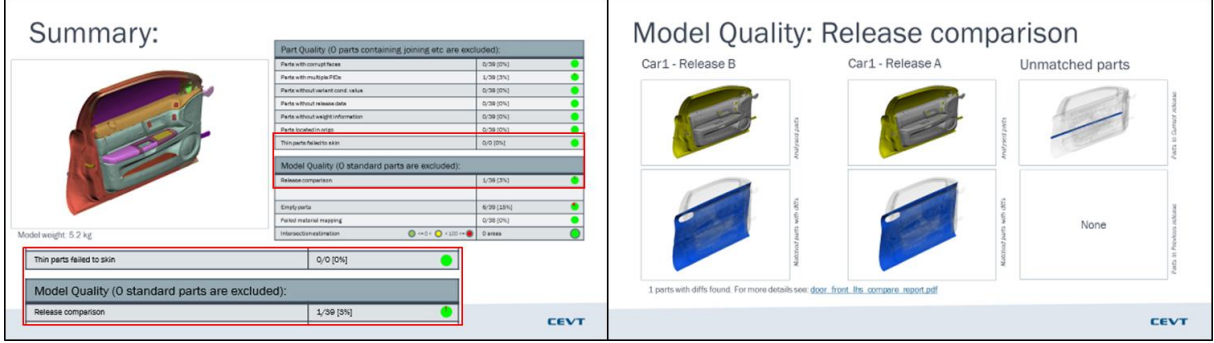
Figure 3 – Quality report example

All data from the ANSA checks, the subsystem statistic and the compare reports are collected and used to create a single quality report on each subsystem using the report composer in METAPOST in PowerPoint format. Key-metrics from each quality report is collected and presented in a single summary report for the release. The summary report provides a quick overview of the quality of the entire release which can consists of hundreds of subsystems.