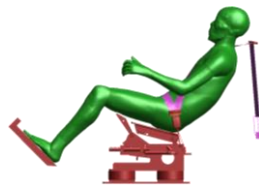
Fig. 2: Setup from Uriot et al. [2] with THUMS v4.1

The now varying HBMs were integrated into the generic seat environment of Uriot et al. [2] and positioned in a reclined seating posture, as illustrated in Fig. 2. In the scope of a following parameter study, all considered geometries were compared by doing a 50 times variation of several input parameter by using a Sobol Sampling method [3]. The aim of this parameter study was to answer the question if some geometries show submarining while others do not under the same conditions.